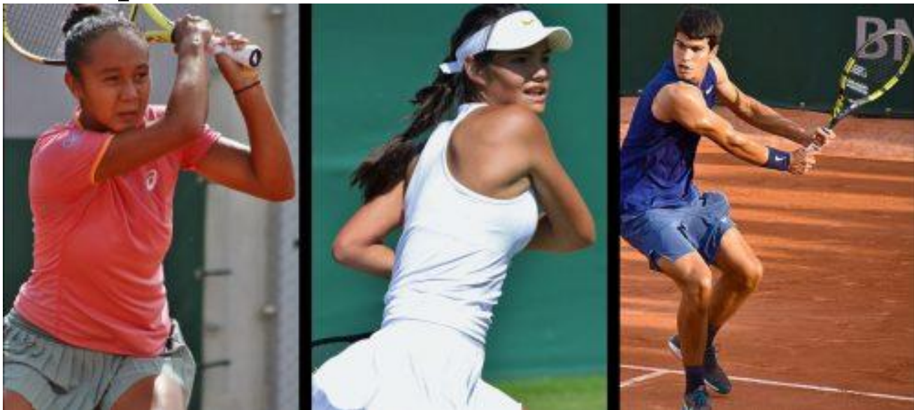
Leylah Annie Fernandez

In tennis, there are many competitions, but four “major” tournaments are considered the most important. They’re called Grand Slam tournaments because winning all four major contests in one year is called a Grand Slam. The US Open is one of these four contests.